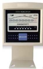
Water quality meter

A variety of option as water storage tank, water quality meter, and UV sterilization lamp are available.