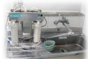
Direct through tap water faucet (Using multi-cock)