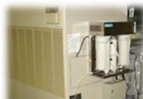
Humidifying water for air conditioner