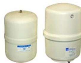
Water pressure tank 10L 40L