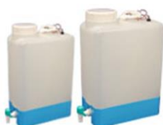
Chemical tank 10L 20L