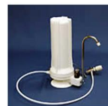
Desk top type ion-exchanger deionizer