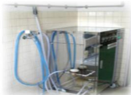
Humidifying water for air conditioner