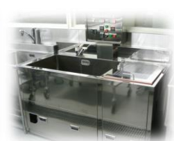
Cleaning water for medical appliance