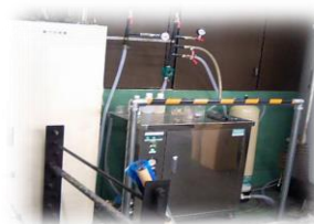
Humidifying water for printing machine