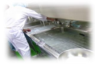
Medical & milk Formulated water