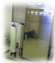
Water for chemical analysis