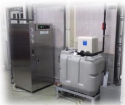
Humidifying water for Printing machine