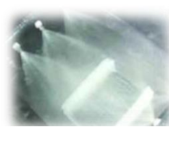
Cleaning water for Substrate, metal parts